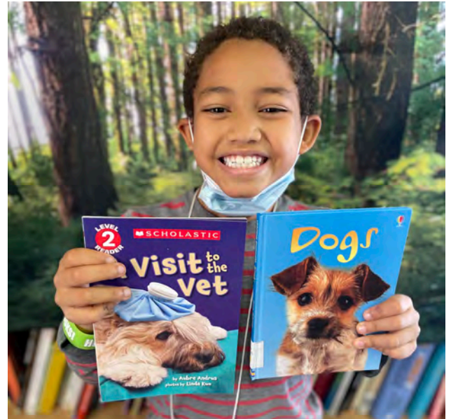
Reading is Magic Summer Camp 2021 Average Student Growth in Oral Reading (fluency and accuracy)